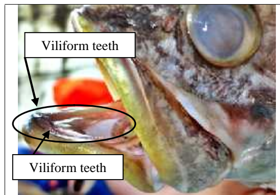
Figure 2. The shape of the teeth barramundi ( Lates calcarifer Block)